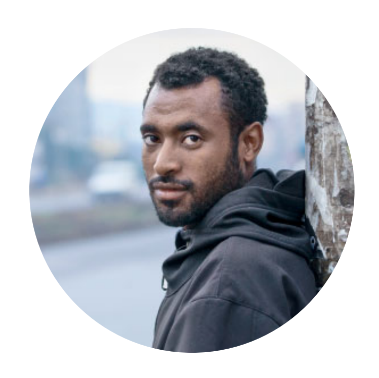
THE WHOLE NINE YARDS

Football pitches for more than 'just sports'