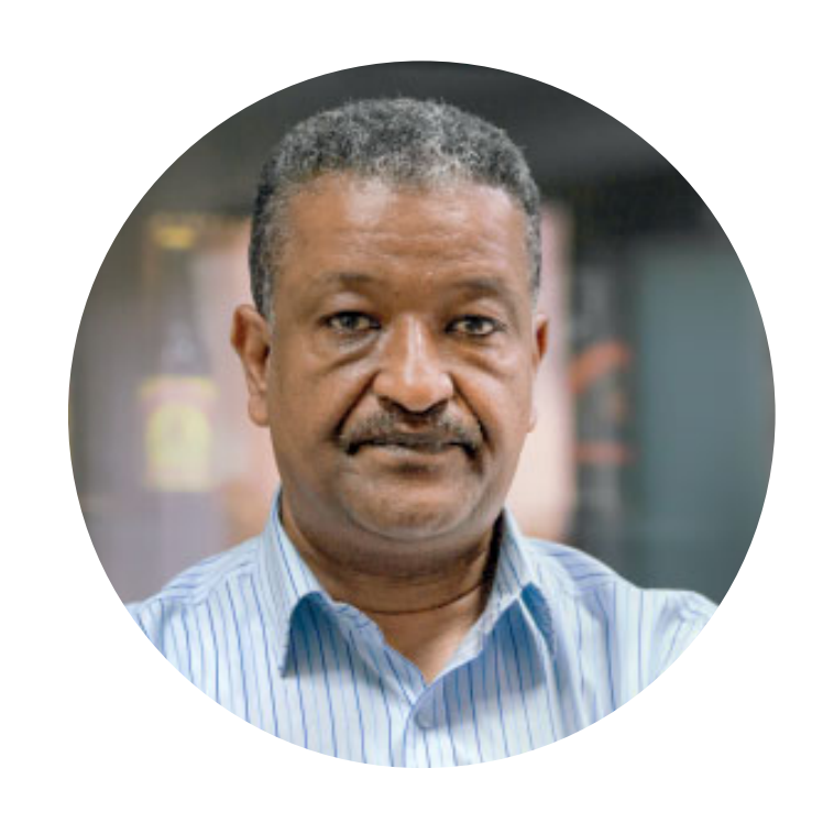
'IT ALL JUST MADE SENSE!'

Sport facilitates private sector engagement