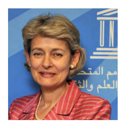
by <u>Irina Bokova</u> , Director-General of UNESCO

UNESCO is the United Nations agency mandated to promote physical education and sport through concerted, collaborative and participatory action to support the rounded development of every individual.