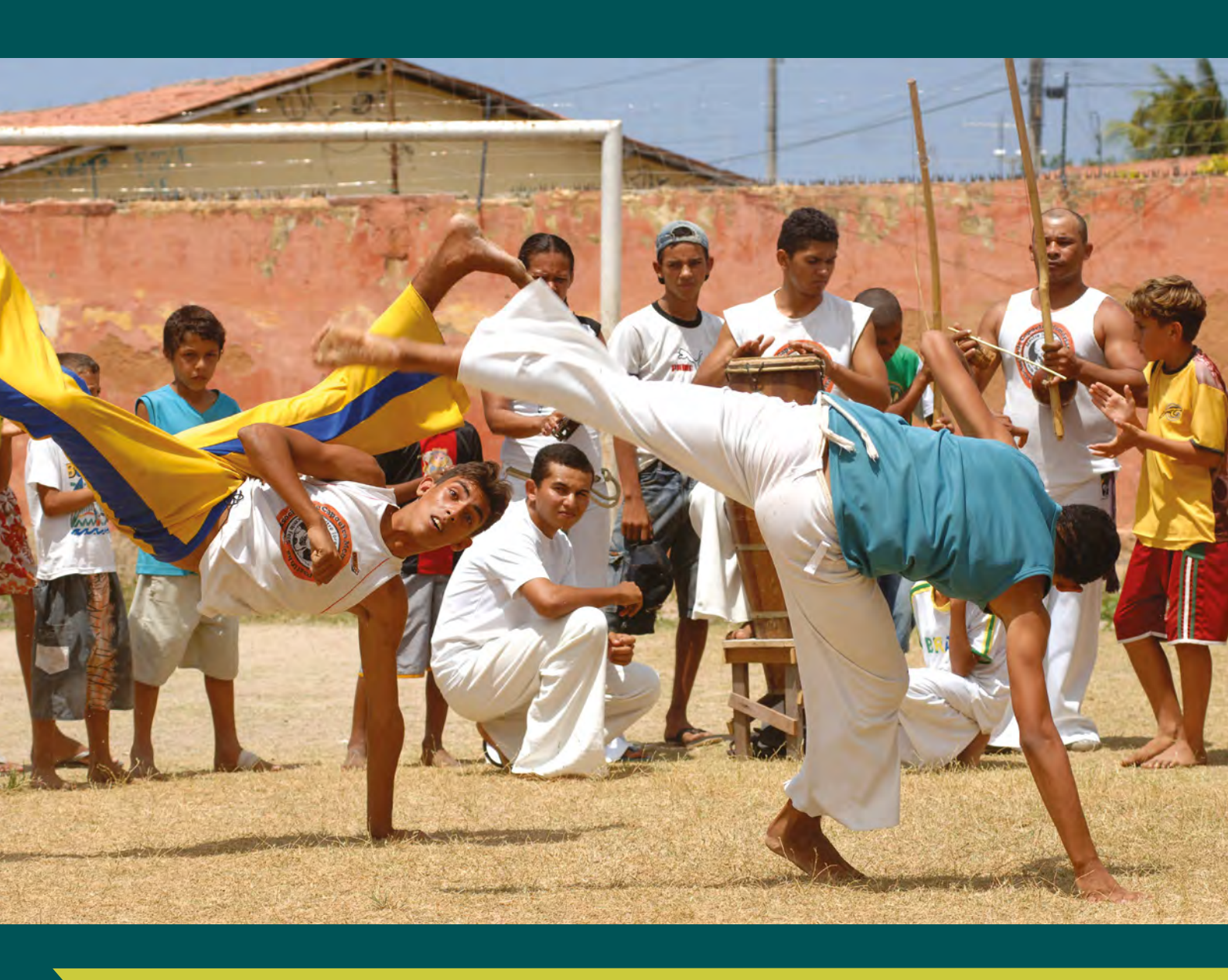
The UNESCO Charter of Physical Education and Sport (1978)

"Every human being has a fundamental right of access to physical education and sport, which are essential for the full development of his personality. The freedom to develop physical, intellectual and moral powers through physical education and sport must be guaranteed both within the educational system and in other aspects of social life."